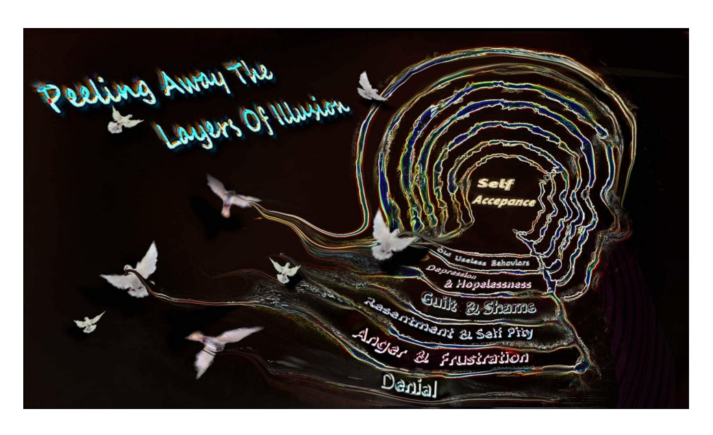
February 18th, 2023

Place: Lourdes Parrish Hall, 4005 Frederica Street, Owensboro, Ky (Across from Big Lots)